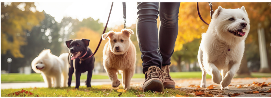
Thanks for being a responsible pet owner and contributing to a beautiful San Bernardino County.

Step 4: Use your canister to pick up after your dog anytime, anyplace!