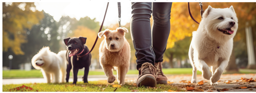
Thanks for being a responsible pet owner and contributing to a beautiful San Bernardino County.

Step 4: Use your canister to pick up after your dog anytime, anyplace!