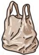
3. PLASTIC BAG