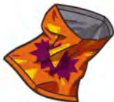
6. CHIP BAG