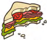
2. FOOD WASTE