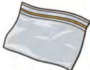
7. SANDWICH BAG